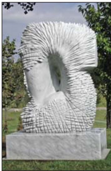
The Rubicon rests in Oakwood Cemetery