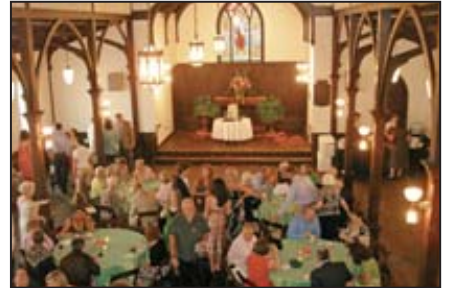
The newly restored All Saints Chapel