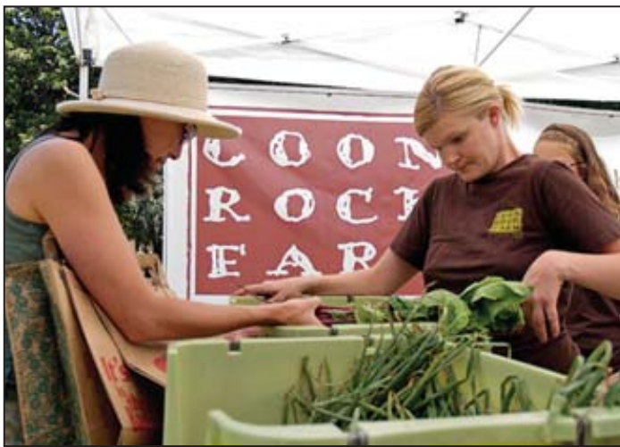
Coon Rock Farms is one of the many farms and vendors selling fresh produce at the Moore Square Farmers Market.