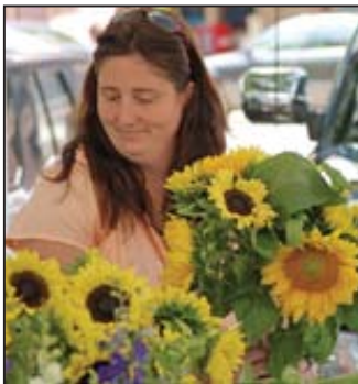
Sunflowers are just one of the many items shoppers will find at the Farmer's Market

"Many moms bring their kids and picnic in the park before and after shopping for excellent local foods—strawberries, lettuce, fresh eggs, ice cream—and soon much more," says Jennifer Noble Kelly, who owns a public relations firm in Raleigh. "It's a charming setting located just across from Marbles (Kids Museum)." Learn more at www.godowntownraleigh.com/farmersmarket .