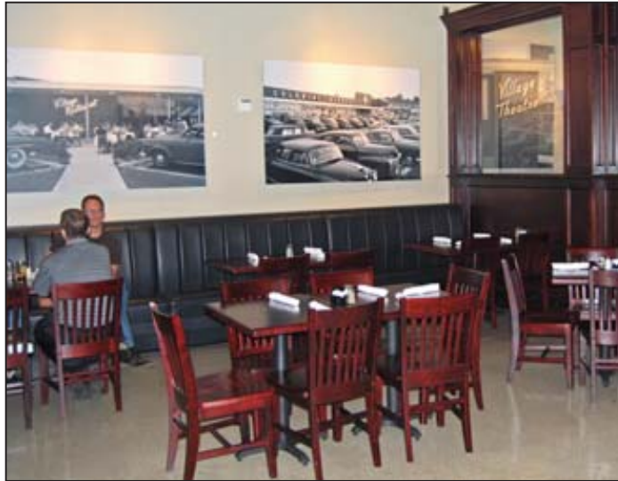
son's eatery, North Ridge Pub.