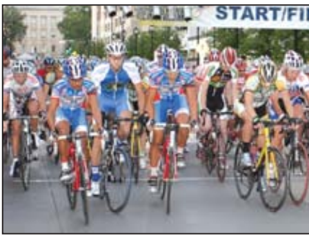
Two bike rides are planned for July 4th: The Firecracker Ride in Cary and the First Annual Bike Parade (paride: a massed, recreational bicycle ride).