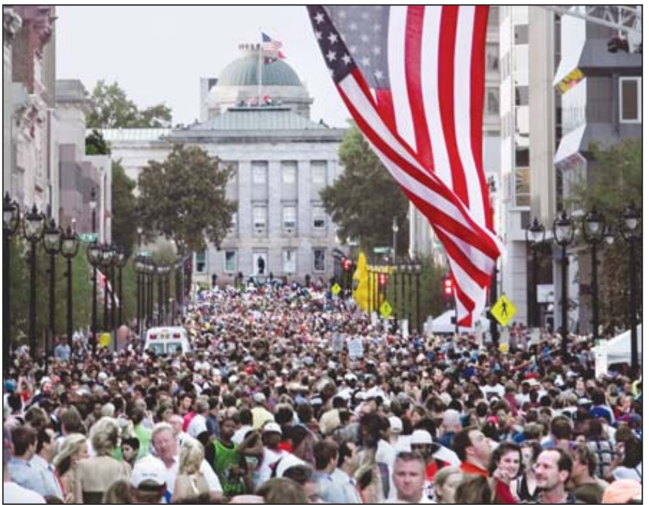
The Third Annual Raleigh Wide Open will be held in September to coincide with the grand opening of the Raleigh Convention Center