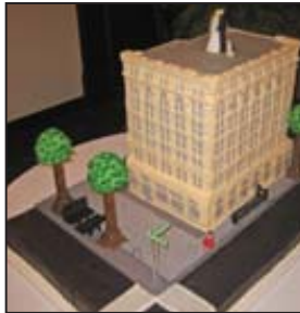
The wedding cake was shaped in the likeness Greg's Empire Properties building (naturally)