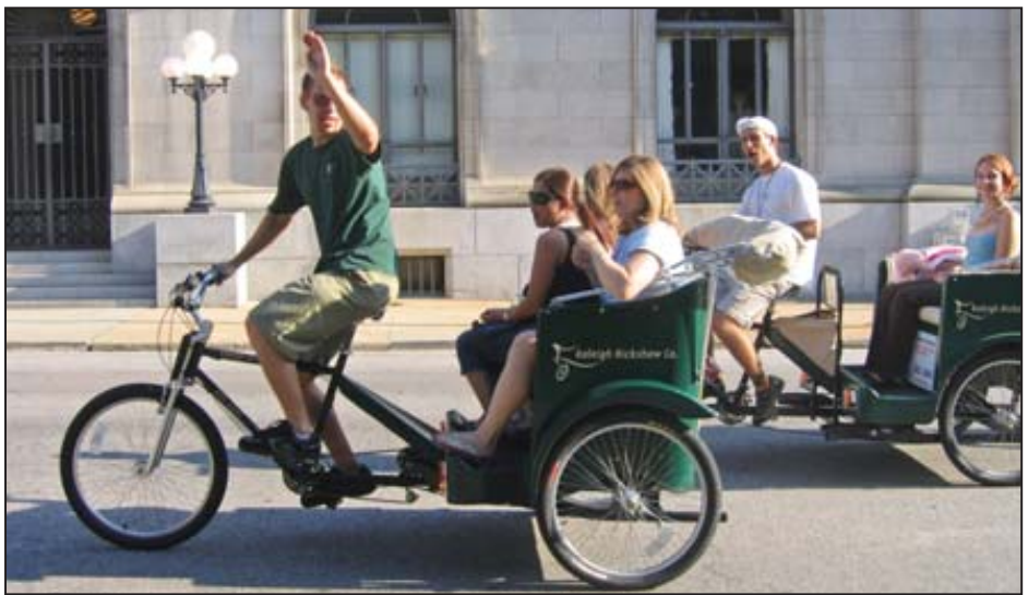
Raleigh Rickshaws provide a fun, alternate, green mode of transportation throughout downtown

Drivers ensure customer comfort by providing them