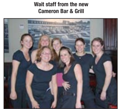
Wait staff from the new Cameron Bar & Grill