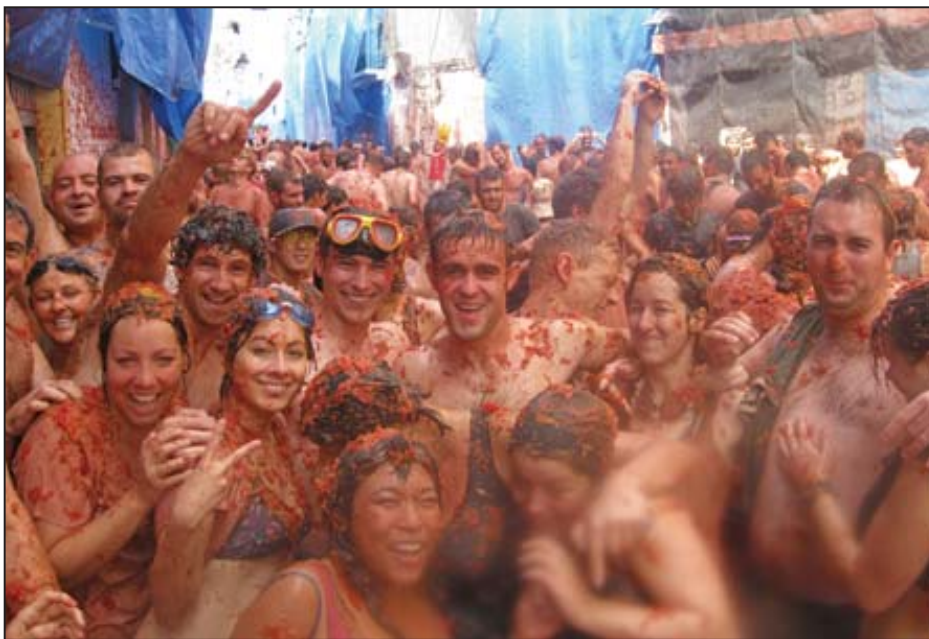
Members of TRI SPORTS Social Club participate in a wide variety of events such as teamsports, evening socials, and a trip to the La Tomatina Tomato Fight in Spain, below.

with the TRI SPORTS Social Club, an organization also known as MEETandCOMPETE.com that assembles Triangle professionals of all ages for basketball, beach volleyball, flag football, soccer, softball and of course, kickball and broomball.