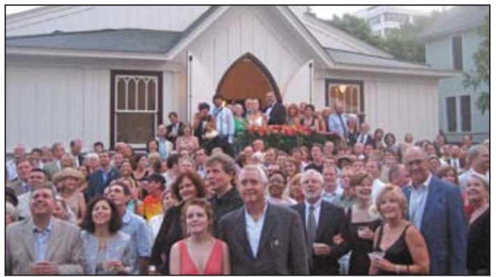
A large crowd of friends and luminaries from the Raleigh political and social scene were present to celebrate with the new couple at their reception